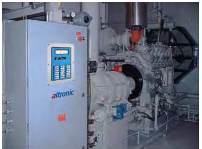
Exacta 21 on a screw compressor