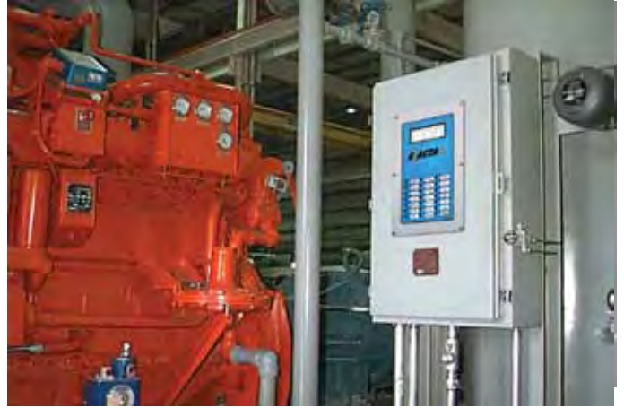
Exacta 21 on a reciprocating compressor

MIDAS (Monitored Information Devices And Systems) is a user-configurable graphical touch screen and data hub that delivers centralized access to critical information in parallel with the Exacta 21, which is mounted completely inside the panel. Unlike traditional PLC-based systems in which the only means of displaying system data is through the touch screen, the MIDAS offers an advanced, user-configurable, graphical data presentation capability, while preserving the high level of reliability and in-depth system configuration and access made possible by the Exacta 21. Essentially, the MIDAS incorporates the very best of both approaches by combining the advanced display capabilities of a PLC-based system with the reliability and servicability of a control panel built around an independent, discrete device.